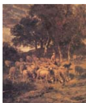
Charles Emile Jacque (1813-1894) A Shepherdess and her Flock, ca. 1867 Oil on canvas 26 x 22 in. (66 x 55.8 cm)