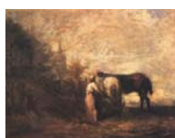
Jean Baptiste Camille Corot Les Chevaux de Wouvermans , ca. 1872-74 Oil on canvas 10 1/4 x 13 3/8 in. (26 x 34 cm) [COR-006]