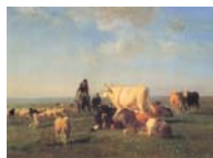
Constant Troyon Cows and Sheep Grazing , 1862 Oil on canvas 31 1/2 x 42 1/2 in. (80 x 108 cm)