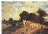
Constant Troyon Le Troupeau au Bord de la Rivière , ca. 1850 Oil on panel