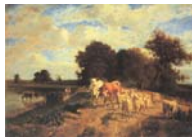
Constant Troyon Le Troupeau au Bord de la Rivière , ca. 1850 Oil on panel 25 1/2 x 36 1/4 in. (64.8 x 92.1 cm)