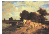
Constant Troyon Le Troupeau au Bord de la Rivière , ca. 1850 Oil on panel 25 1/2 x 36 1/4 in. (64.8 x 92.1 cm) [TRO-004]