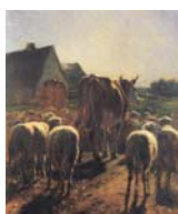
Constant Troyon Retour de Troupeau , ca. 1850 Oil on canvas 28 3/8 x 23 5/8 in. (72 x 60 cm)

[TRO-002] 72,000.00 less 10% discount -7,200.00 64,800.00