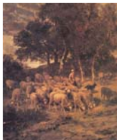
Charles Emile Jacque (1813-1894) A Shepherdess and her Flock, ca. 1867 Oil on canvas 26 x 22 in. (66 x 55.8 cm)