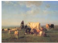
Constant Troyon Cows and Sheep Grazing , 1862 Oil on canvas 31 1/2 x 42 1/2 in. (80 x 108 cm)