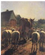
Constant Troyon Retour de Troupeau , ca. 1850 Oil on canvas 28 3/8 x 23 5/8 in. (72 x 60 cm)