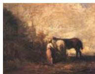
Jean Baptiste Camille Corot Les Chevaux de Wouvermans , ca. 1872-74 Oil on canvas 10 1/4 x 13 3/8 in. (26 x 34 cm) [COR-006]