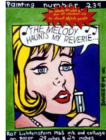
Sally Davies (b. 1957) Painting no. 239: Lichtenstein -- My Melody Haunts Your Reverie, 1994 Acrylic on canvas 66 x 48 inches on face: (c) DAVIES 94 DA-00697