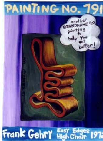
Sally Davies (b. 1957) Painting no. 791: Frank Ghery Chair, 1997 Acrylic on canvas 14 x 10 inches on face: (c) DAVIES 96 DA-00597