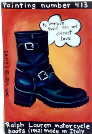
Sally Davies (b. 1957) Painting no. 413: Ralph Lauren Motorcycle Boot, 1994 Acrylic on canvas 42 x 28 inches on face: (c) DAVIES 94 DA-00497