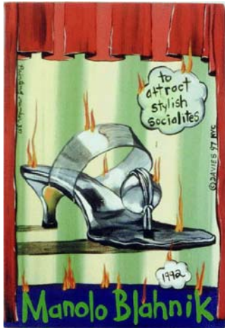
Sally Davies (b. 1957) Painting no. 351: Manolo Blahnik Shoe, 1997 Acrylic on canvas 15 x 10 inches on face: (c) DAVIES 96 DA-00197